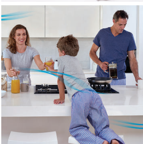
Skylights, Ventilation – Roof, Room and Whole House