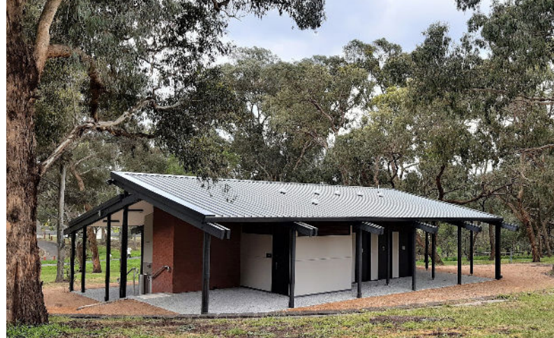
Set amongst mature shaded trees, the Solatube tubular skylights allow maximum daylight to filter into the interior.